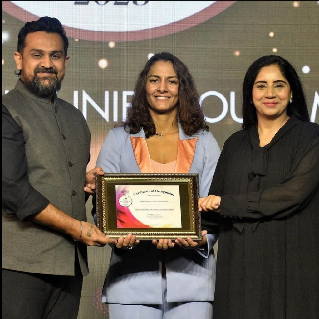
Our Centre Director receiving the 'Times Of India' award.